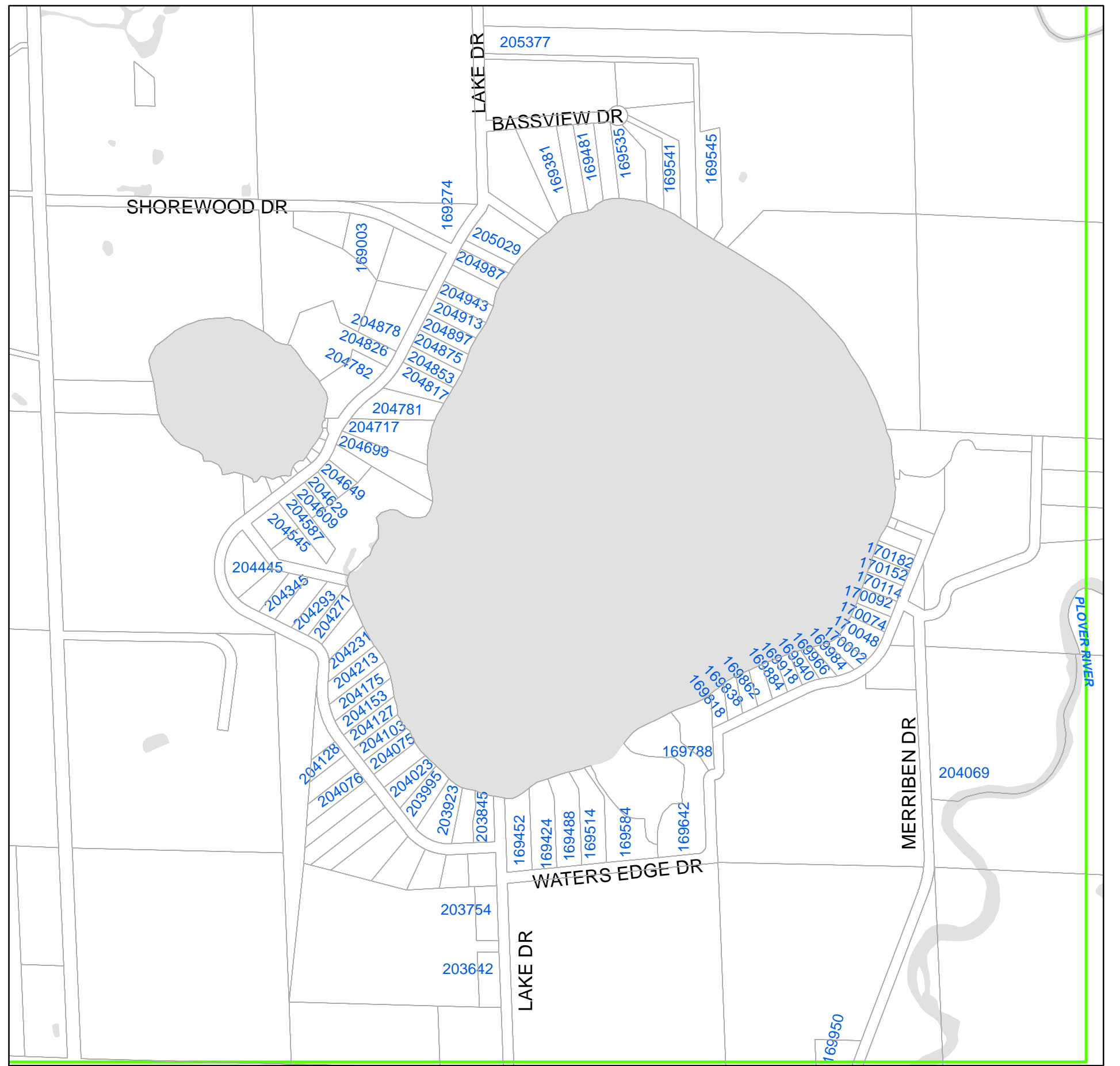
BIG BASS LAKE