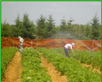
Maplewood Gardens-Elderon, WI