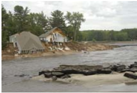
Lake Delton, WI U.S. Air Force

If you need assistance viewing your maps, contact the Conservation, Planning and Zoning Department, 715-261-6040