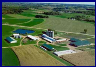
Seehafer Farm McMillan